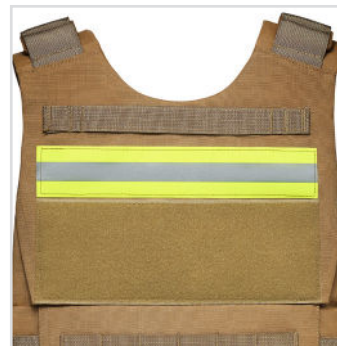
REAR DRAG STRAP